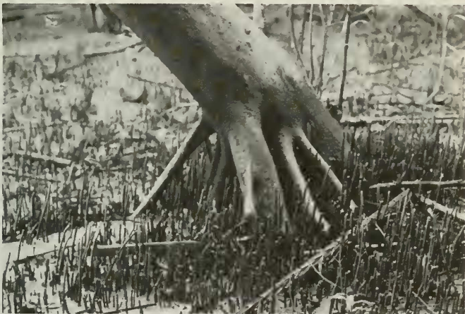
Fig. 1. Avicennia officinalis, showing pneumatophores and prop-roots. Sg. Santoboug, Janyary 21, 1976